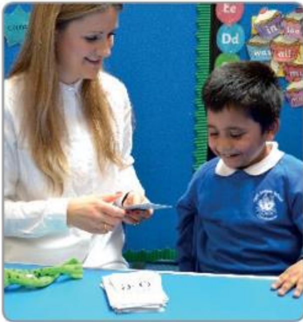
Learning the Speed Sounds in the classroom.